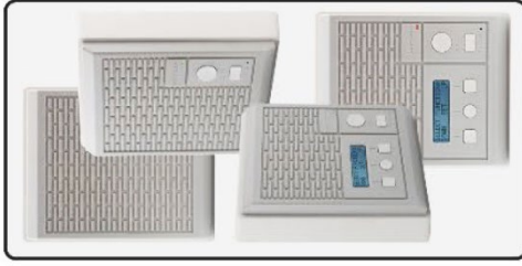
Wireless 2-Way Intercom Stations