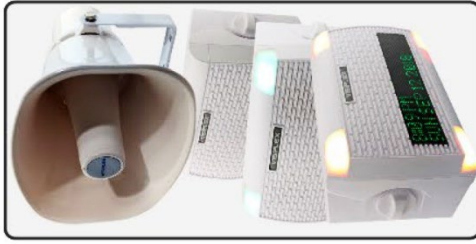
Wireless Indoor/Outdoor PA Speakers