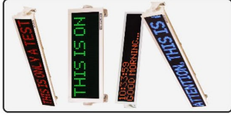
Wireless LED Message Boards