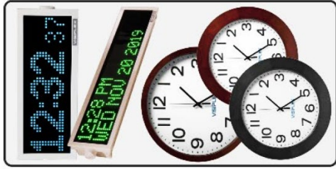
Wireless Time Synchronized Clocks