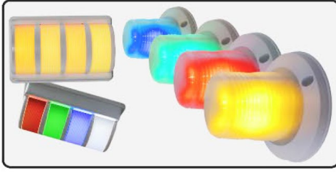
Wireless Visual Alert Devices