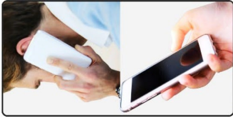
Wireless SMS Text & Voice Notification