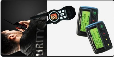
Wireless 2-Way Radios & Pagers